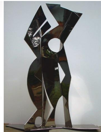
Break Dancing by Sica