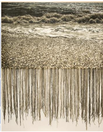
Summer by Leda Black