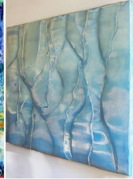
Crystal Blue by Joan Konkel