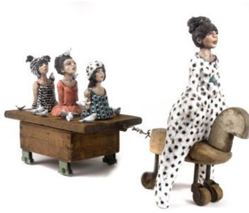
All Aboard The Train by Elissa Farrow-Savos