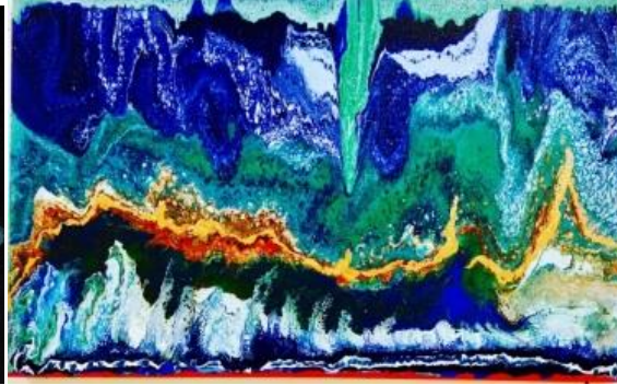
A Fire Within by Lea Craigie-Marshall